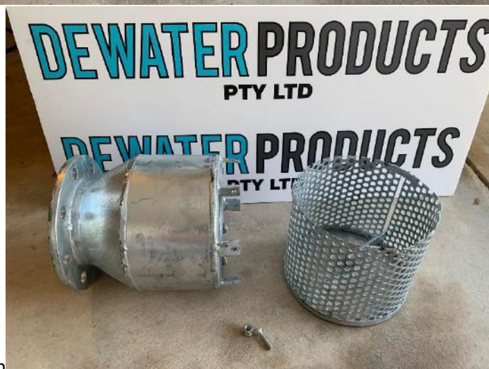
Size: DN100 (4") shown